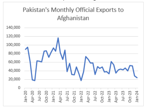
Figure 2 Pakistan's Exports to Afghanistan